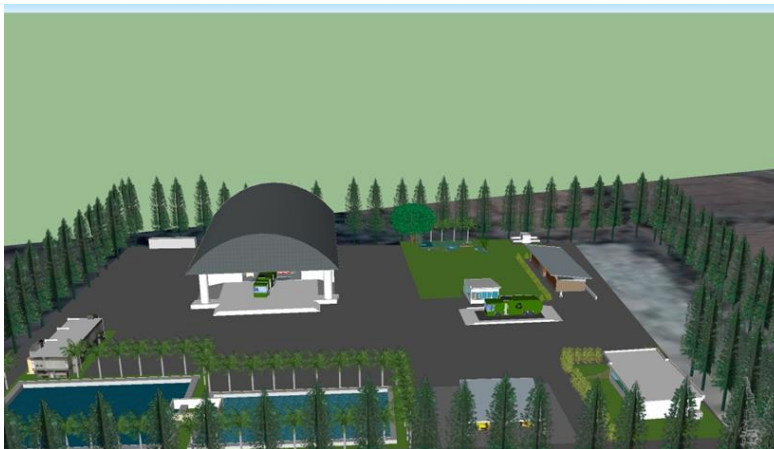
Figure 3. Layout design examples WapiPathum transfer station.