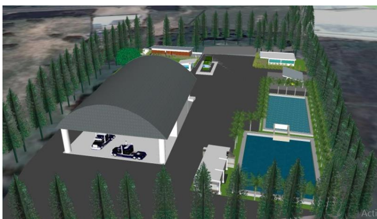
Figure 4. Layout design examples PhayakkhaphumPhisai transfer station.