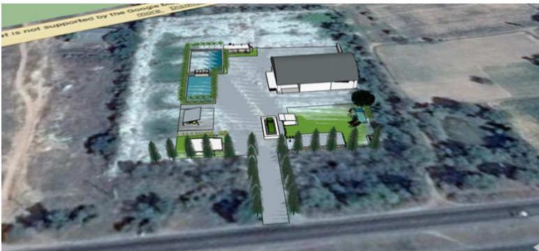
Figure 2. Layout design examples Borabue transfer stations.